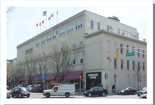
A portion of the site was occupied by Epstein's Department Store

Preliminary & Final Site Plan Morristown, Morris County, NJ CLIENT: Morristown Epstein's LLC